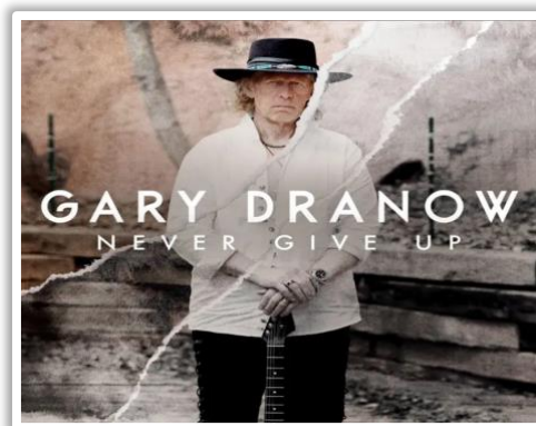
Cover Art for "NEVER GIVE UP" project